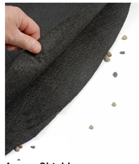
Armor Shield Protection System See last page for details