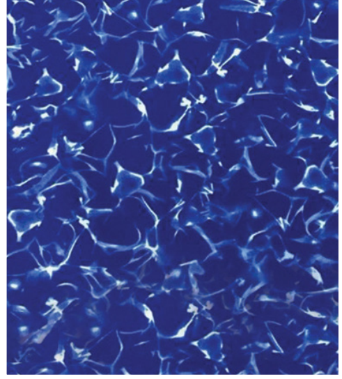
Maui Blue Overlap