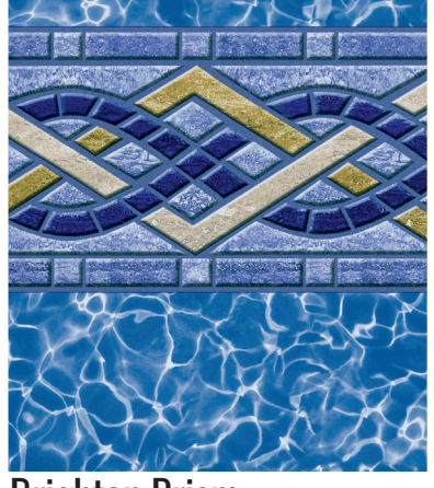
Brighton Prism Unibead 52", 54" *Available in Esther Williams Bead