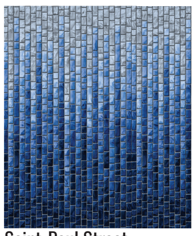
Saint-Paul Street Midnight Stone Unibead 52". 54"