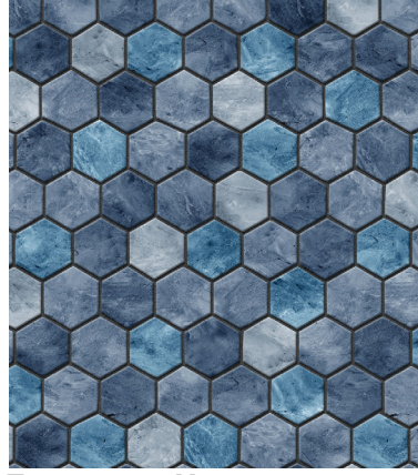
Travertine Hex Unibead 52", 54"