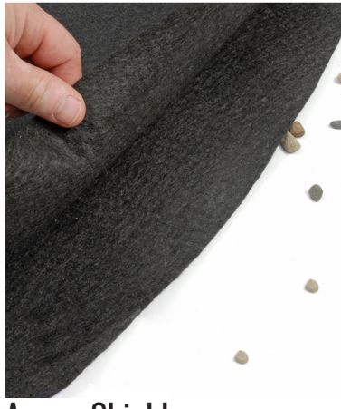
Armor Shield Protection System See last page for details