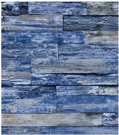
Blue Mount Royal Unibead 52", 54"