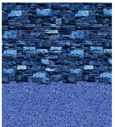
Flagstaff Unibead 48", 52", 54"