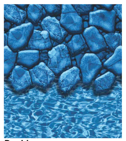
Boulder Unibead 48", 52", 54"