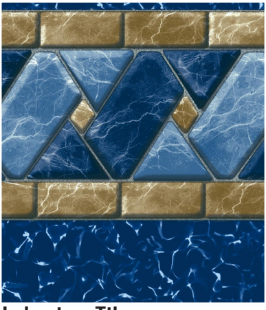
Lakeview Tile Unibead 52", 54"